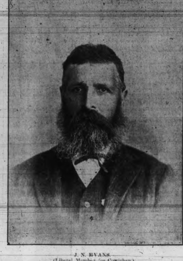
(Liberal Member for Cowichan)

"Friend of the Family. "Friend of the Family." The new farcical comedy, "Friend of the Family," comes to the Victoria theatre Thursday evening, and judging from the press comments from other cities, lovens of this class of amusement which is the reigning fad in New York city this season, are to enjoy a treat. The plot, which is exceedingly unique and scrammingly farcient, deals with the endeavors of a young importur of Chinese